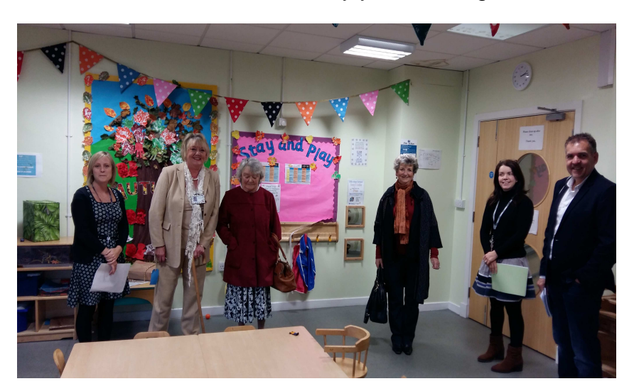
Visit to Children's Centre in Penlan

3.8.7 Flying Start/Children's Centres providers have parental inclusion and involvement built into every part of their work with children, from working with pregnant women, young mothers and dads through to the transition to school as children leave the early years setting.